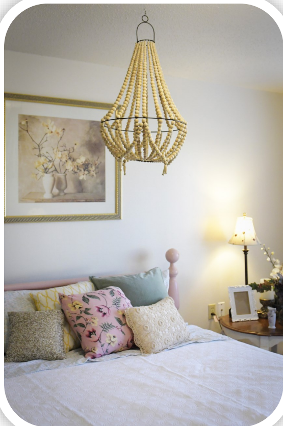
The finished product!